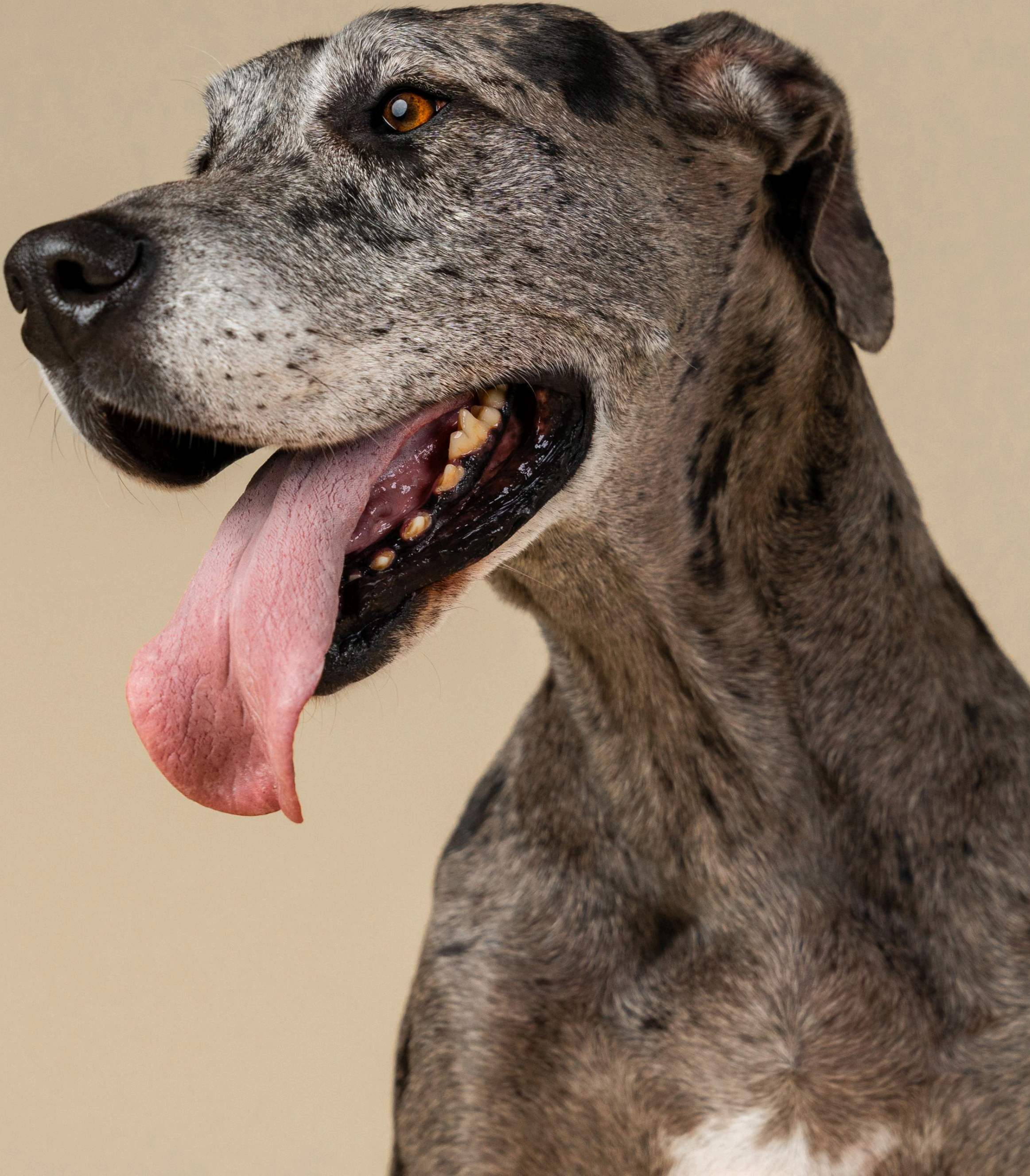
Akila Age 7