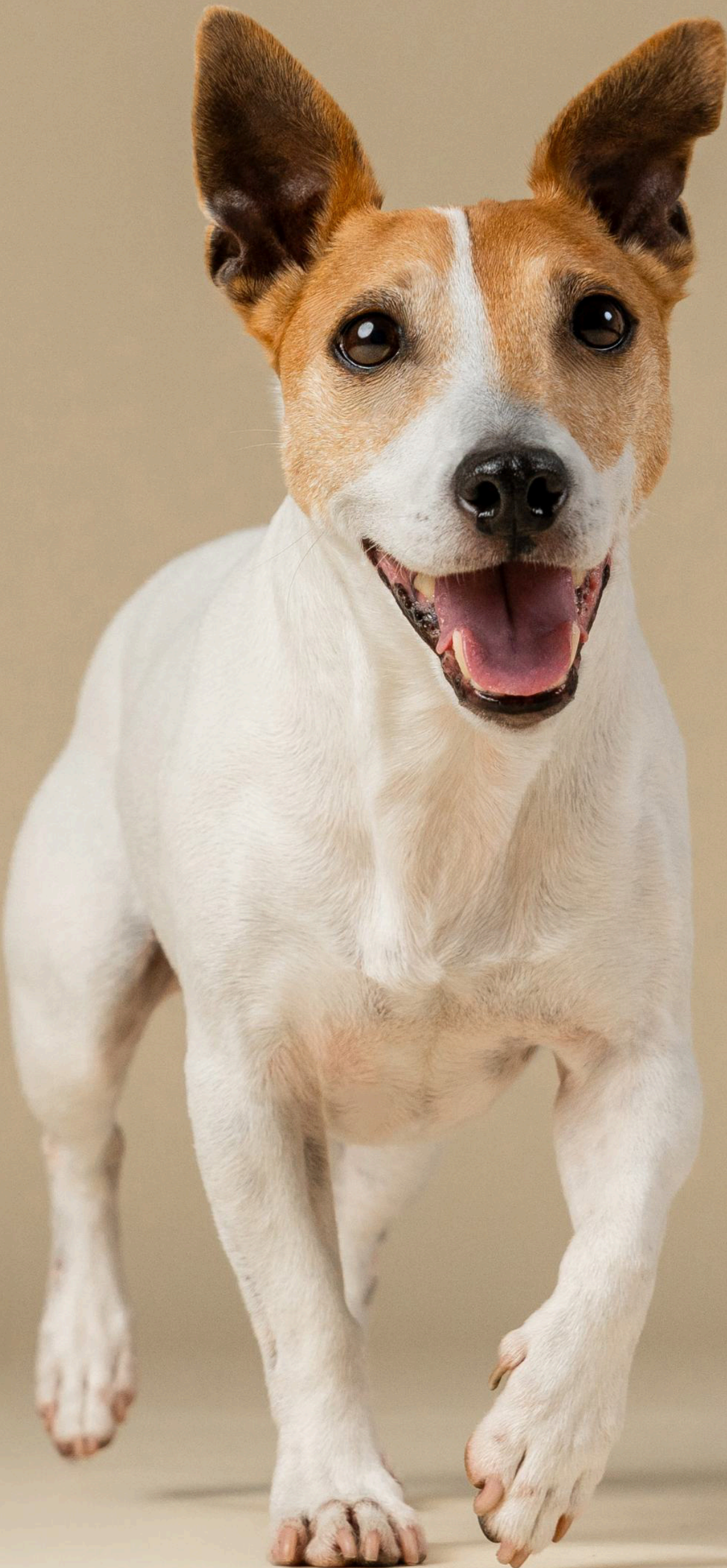
Milo Age 10